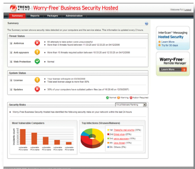
WFBS-H console displaying the status